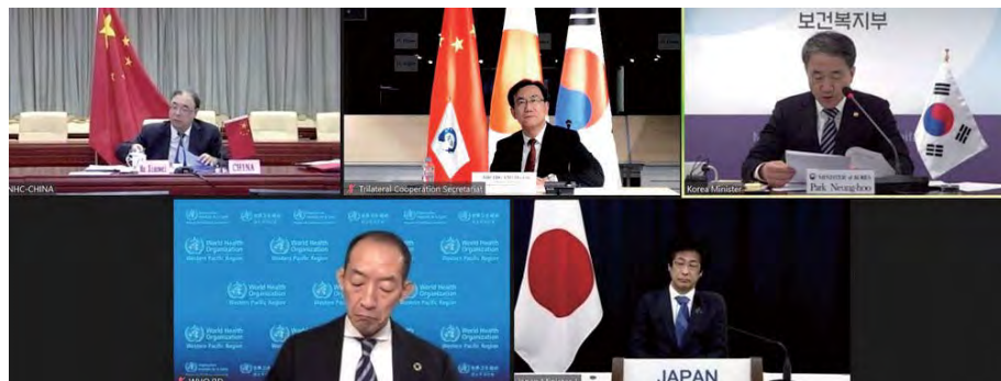
13 th Tripartite Health Ministers' Meeting