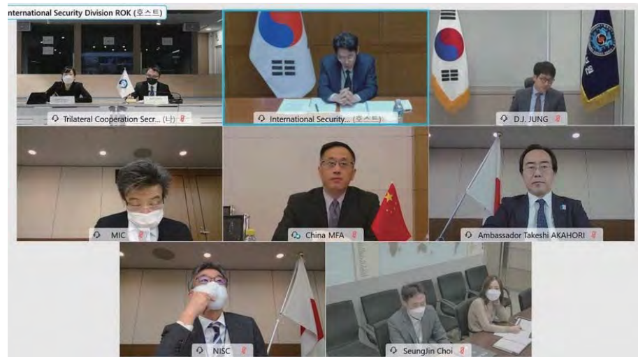
5 th Trilateral Cyber Policy Consultation

The 5 th Trilateral Cyber Policy Consultation was held online on December 9, 2020. Ambassador for International Security Affairs and Special Advisor to the Minister, Ministry of Foreign Affairs of the ROK, Coordinator of Cyber Affairs, Ministry of Foreign Affairs of China, and Ambassador in charge of Cyber Policy, Ministry of Foreign Affairs of Japan, as well as representatives from relevant ministries and agencies attended the consultation.