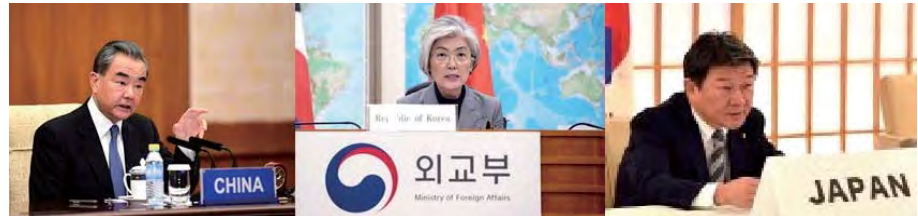
Foreign Ministers' Video Teleconference on COVID-19

The Foreign Ministers' Video Teleconference on COVID-19 was held on March 20, 2020. Foreign Ministers of the three countries exchanged views on the COVID-19 outbreak. The three Ministers shared information on domestic situations and responses regarding COVID-19, and discussed the overall effects caused by the COVID-19 outbreak on exchanges and cooperation between countries and the global economy. The three Ministers agreed to continue close consultations among the diplomatic authorities of the three countries to communicate closely to respond more effectively to the spread of COVID-19, while reaffirming the importance of trilateral cooperation in this respect.