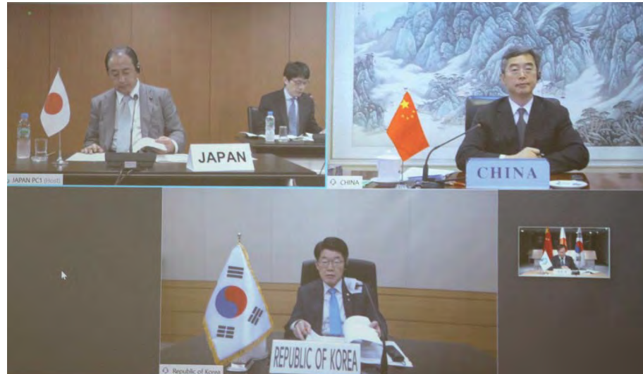
Special Session of the 8 th China–Japan–Korea Ministerial Conference on Transport and Logistics

The Special Session of the 8 th China-Japan-Korea Ministerial Conference on Transport and Logistics was held among the Ministry of Land, Infrastructure, Transport, and Tourism of Japan, Ministry of Transport of China, and Ministry of Ocean and Fisheries of Korea on June 29, 2020, via teleconference.