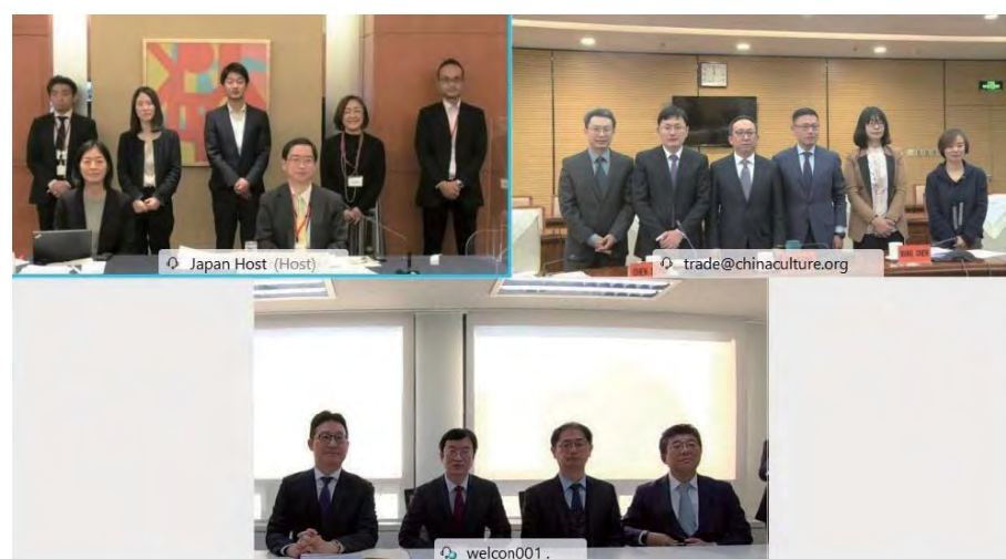
13 th Trilateral Cultural Content Industry Forum

Dunhuang and Shaoxing of China, Kitakyushu of Japan, and Suncheon of the ROK were designated as the 2021 Culture Cities of East Asia (CCEA) respectively by Ministry of Culture and Tourism (MCT) of China, Ministry of Education, Culture, Sports, Science and Technology (MEXT) of Japan, and Ministry of Culture, Sports and Tourism (MCST) of the ROK.