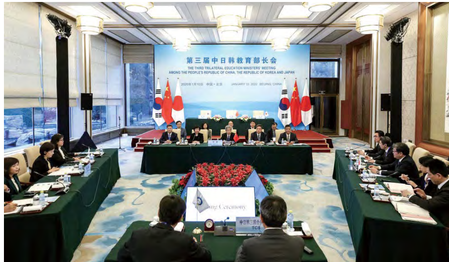
3 rd Trilateral Education Ministers' Meeting

The 3 rd Trilateral Education Ministers' Meeting was held in Beijing, China on January 10, 2020. The Ministers from the three countries discussed 1) promoting youth exchanges and mutual understanding, 2) promoting the establishment of the Asian Higher Education Community through the expansion of the Collective Action for Mobility Program of University Students in Asia (CAMPUS Asia Program), 3) expanding cooperation areas and lifting education to serve communities, and 4) enhancing trilateral education cooperation for promoting regional and global education. The three Ministers recognized TCS' contributions to the CAMPUS Asia Program development at the meeting. In the "Joint Statement of the 3 rd Trilateral Education Ministers' Meeting", the Ministers acknowledged TCS' efforts made through the CJK Joint Research Project and agreed to work with TCS to establish a CAMPUS Asia Alumni Network.