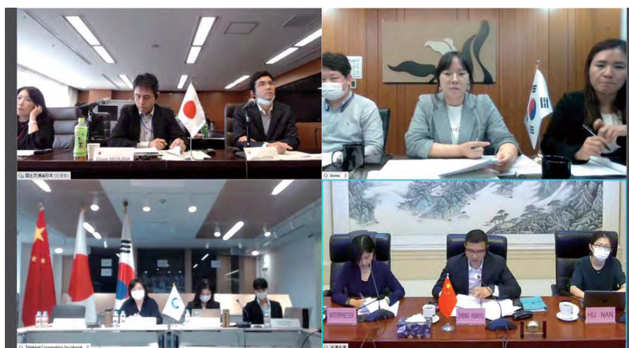
Transport and Logistics Ad Hoc China–Japan–Korea Directorial Video Meeting

Fisheries of Korea on June 5, 2020. Concerning the impact of COVID-19 on the supply chain, the three parties discussed the future steps to keep communications and strengthen cooperative actions for further development of logistics in Northeast Asia.