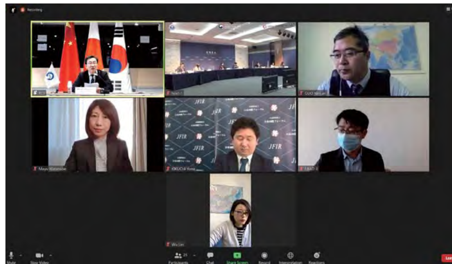
5 th NTCT National Focal Points Meeting & 2020 NTCT Conference