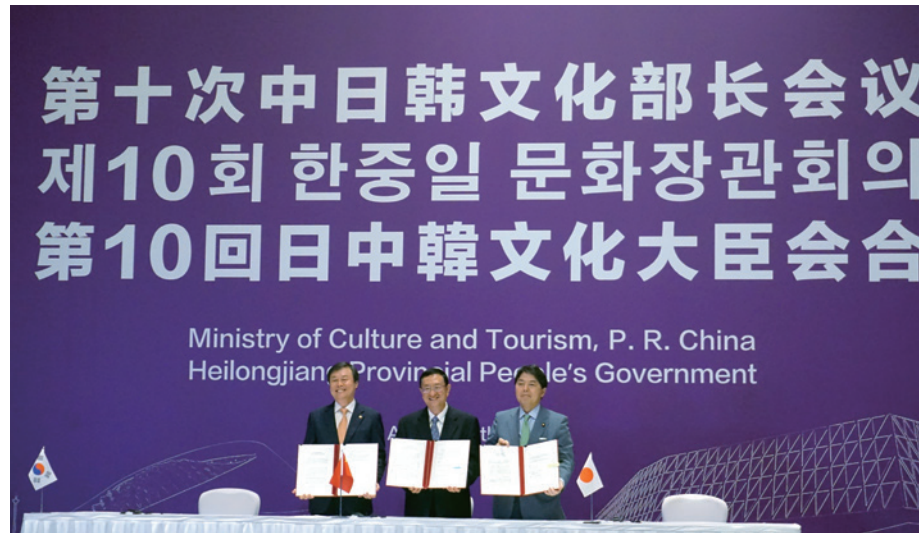
10 th Trilateral Culture Ministers' Meeting

The 10 th Trilateral Culture Ministers' Meeting was held in Harbin, China, on August 30, 2018. At the meeting, the three ministers reviewed the progress of the follow-ups of “Qingdao Action Plan”, “Jeju Declaration 2016” and “Kyoto Declaration 2017”, and acknowledged the achievements made in the field of trilateral cultural cooperation and exchange. Under the recognition of the need to consolidate the future-oriented trilateral relations by promoting cultural exchange in different levels, the ministers signed the “Harbin Action Plan”, which stipulated a series of decisions to facilitate cooperation in 1) Culture City of East Asia (CCEA) Program, 2) support and reinforcement for the cooperation of cultural and arts institutions among three countries, 3) joint cultural program during the Olympic and Paralympic Games, and 4) explore possible cooperation in other cultural fields. The ministers at the press conference also announced the designation of Xi’an of China, Toshima of Japan, and Incheon of the ROK as the CCEA 2019.