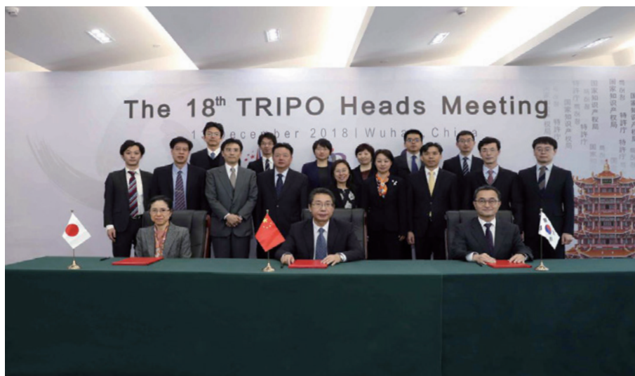
18 th TRIPO Heads Meeting

three offices introduced each country's current status and had in-depth discussions on various topics for trilateral cooperation activities regarding the fields of trials and appeals, designs, and development of human resources. Moreover, the three offices shared a common view to emphasize and further strengthen trilateral cooperation among them. The 6 th TRIPO User Symposium was held on the same day after the 18 th TRIPO Heads Meeting.