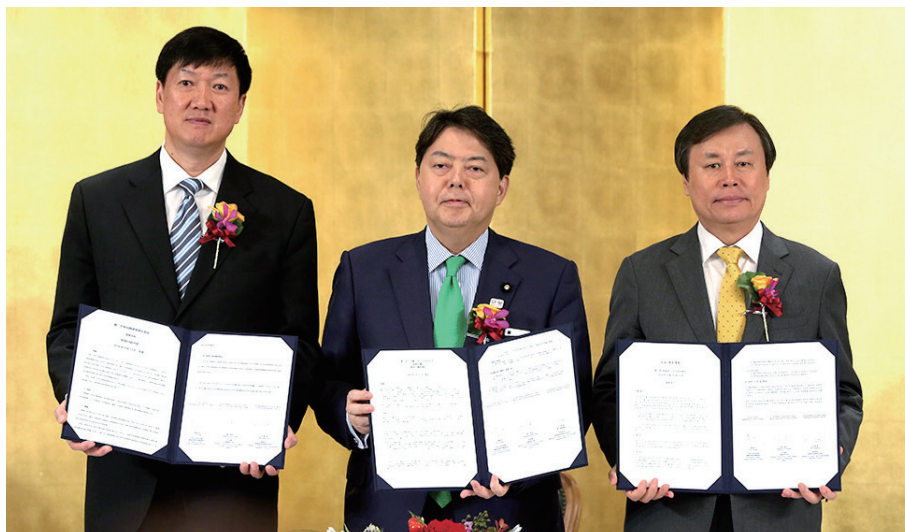
2 nd Trilateral Sports Ministers' Meeting