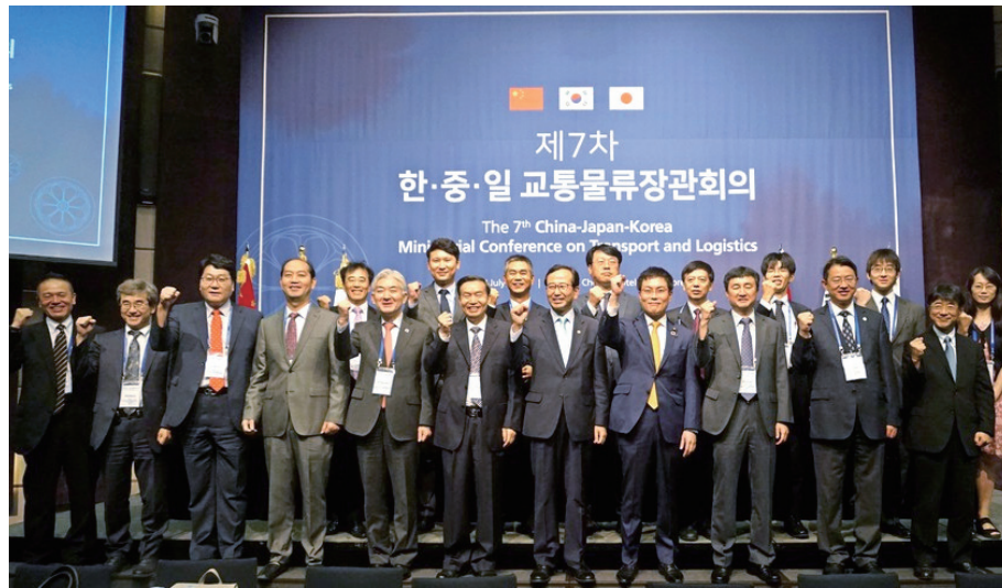
7 th Trilateral Ministerial Conference on Transport and Logistics

commitment to the three main goals of the trilateral transport and logistics cooperation which were 1) creation of seamless logistics system, 2) establishment of environmentally friendly logistics, and 3) achievement of balance between logistics security and efficiency. They also reviewed the newly arranged 11 Action Plans under the three main goals.