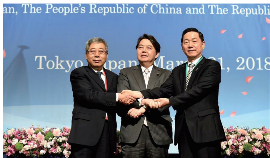
2 nd Trilateral Education Ministers' Meeting

The 2 nd Trilateral Education Ministers' Meeting was held in Tokyo, Japan on March 21, 2018. The meeting was presided by the Minister of Ministry of Education, Culture, Sports, Science and Technology (MEXT) of Japan. The Minister of Ministry of Education of China and the Minister of Ministry of Education of the ROK joined the meeting. During the meeting, the ministers reviewed the progress made in line with the “Seoul Declaration for Trilateral Education Cooperation” from the 1 st Education Ministers' Meeting held in 2016. Building upon this discussion, the ministers agreed to 1) promote and expand student exchanges among the three countries, 2) further cooperation in higher education through CAMPUS Asia Program and by developing a joint research project on mutual recognition of degrees, and 3) strengthen the network with multilateral partnerships through UNESCO, ASEAN+3, Trilateral Summit and ASEM.