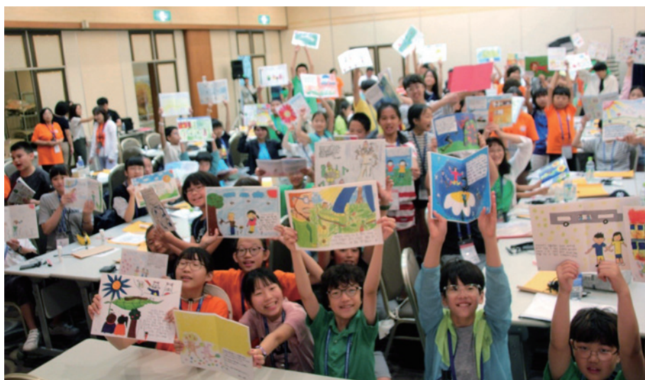
15 th China-Japan-ROK Children's Story Exchange (CSE)

The 15 th China-Japan-ROK Children's Story Exchange (CSE) was held in Tokyo and Yamagata, Japan on August 17-23, 2018 under the theme of “flower”. The TCS served as the co-organizer responsible for the alumni program for the second time. The TCS program developed for the alumni included guest lectures by CAMPUS Asia graduates from University of Tokyo, CSE alumni community strategy development workshop, hands-on activities, and presentations to the members of Parliamentary Association for the Future of Children. Selected primary school students participated in field trips and storybook making activities.