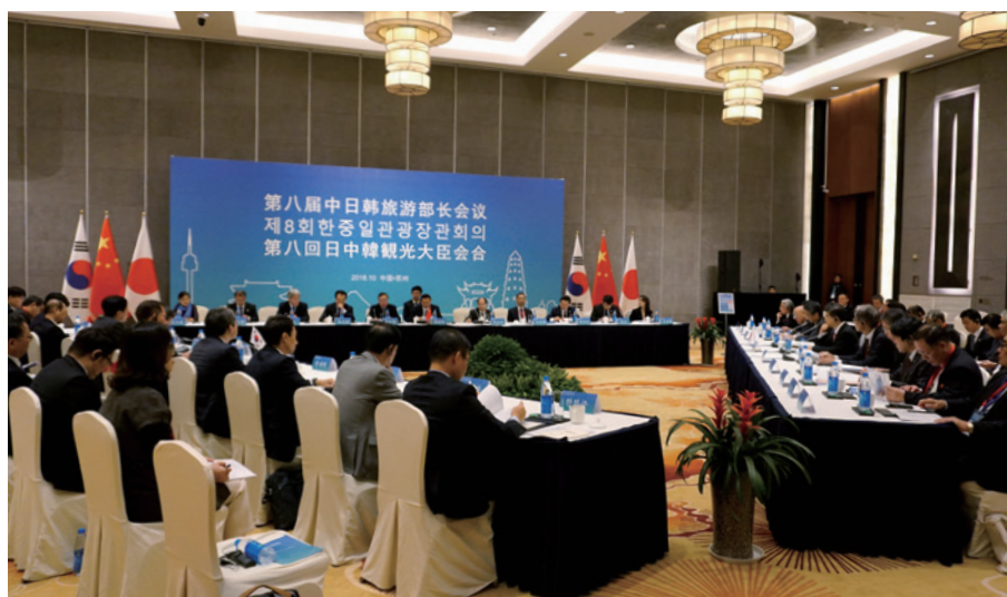
8 th Trilateral Tourism Ministers’ Meeting

The 8 th Trilateral Tourism Ministers’ Meeting was held in Suzhou, China on October 27, 2018. Under the theme of “Promoting sound, stable and sustainable regional cooperation through tourism”, the three ministers exchanged their views on 1) improving the level of travel convenience, creating an economically open and integrated China-Japan-Korea cooperation, and strengthening cultural and people-to-people exchanges through expanding the trilateral tourism cooperation, 2) promoting the quality and standardization of regional tourism, actively strengthening youth tourism exchange, and further enhancing the importance of East Asian tourism in the world tourism industry surrounding the theme of “sustainable development”, and 3) further deepening the pragmatic cooperation among China, Japan and the ROK through Olympic Games, joint promotion on “Visit East Asia Campaign”, and improvement of tourism safety response system. “Suzhou Joint Statement” was adopted at the meeting.