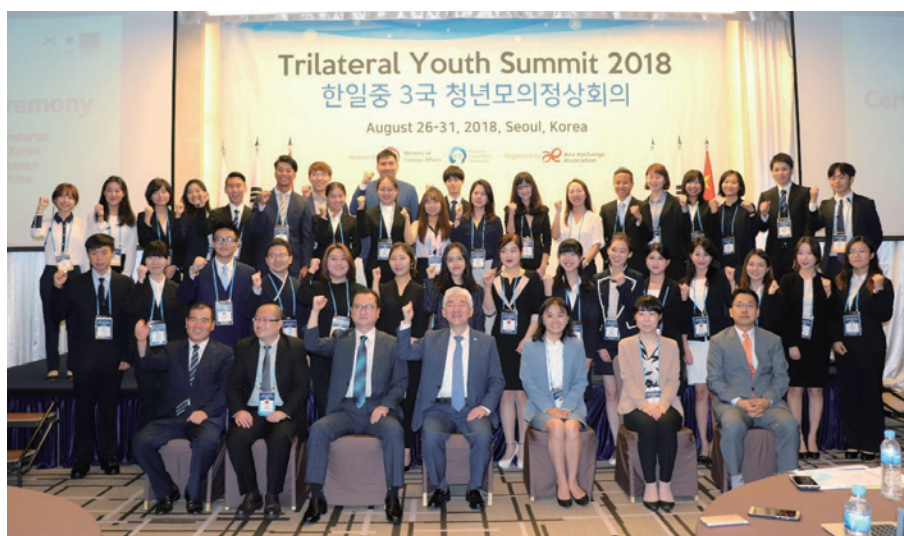
Trilateral Youth Summit 2018

dust and air pollution), 2) Economic Committee (TC towards Trilateral FTA), and 3) Cultural Committee (TC for successful Olympic Games in Northeast Asia). Through lectures, delegation meetings, and committee meetings, the students adopted a Joint Statement during the model summit.