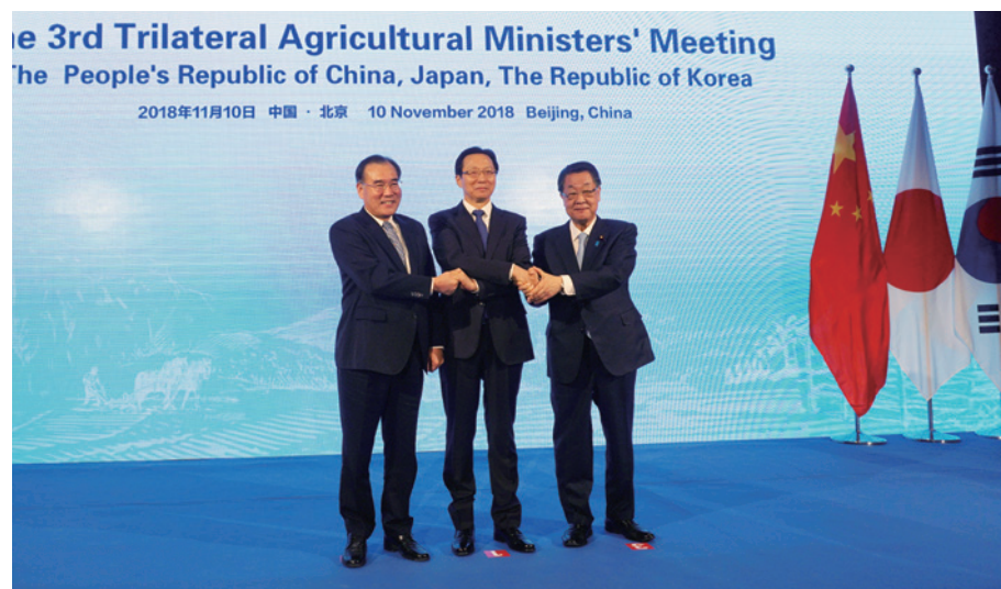
3 rd Trilateral Agricultural Ministers' Meeting

The 13 th Forum for Agricultural Policy Research in Northeast Asia was held in Seogwipo, the ROK on May 31, 2018. The forum was co-hosted by Korea Rural Economic Institute (KREI), Institute of Agricultural Economics and Development of Chinese Academy of Agricultural Sciences (IAED/CAAS) and Japan Policy Research Institute of Ministry of Agriculture, Forestry and Fisheries (PRIMAFF). The presentations and discussions covered topics of “Improving workforces for strengthening agricultural and rural competitiveness” and “Rural welfare”.