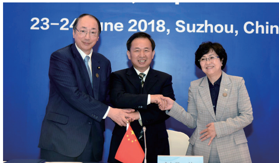
20 th Tripartite Environment Ministers' Meeting (TEMM20)

As side events of the Ministers' Meeting, the Tripartite Roundtable on Environmental Business themed "Environmentally Sustainable City for Promoting the Transition