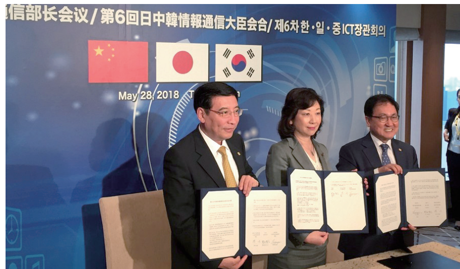
6 th Trilateral ICT Ministerial Meeting

The 6 th Trilateral ICT Ministerial Meeting was held in Tokyo, Japan on May 28, 2018. Ministry of Internal Affairs and Communications of Japan, Ministry of