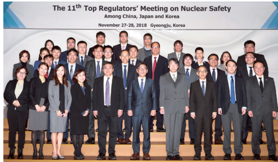
11 th Top Regulators' Meeting (TRM) on Nuclear Safety

The 11 th Top Regulators' Meeting (TRM) on Nuclear Safety among Nuclear Safety and Security Commission (NSSC) of the ROK, Ministry of Ecology and Environment/National Nuclear Safety Administration (MEE/NNSA) of China, and Nuclear Regulation Authority (NRA) of Japan was held on November 27, 2018 in Gyeongju, the ROK. The three authorities presented the updates of nuclear safety activities in each country, and reviewed the outcomes of the 5 th Joint Emergency Drill (JED), as well as the three working groups established under the TRM framework: WGHRD (Working Group on Human Resources Development), WGOIS (Working Group on Online Information Sharing), and WGEPR (Working Group on Emergency Preparedness and Response). To commemorate the 10 th anniversary of the TRM, the three sides also discussed the achievements, challenges and future direction of the cooperation.