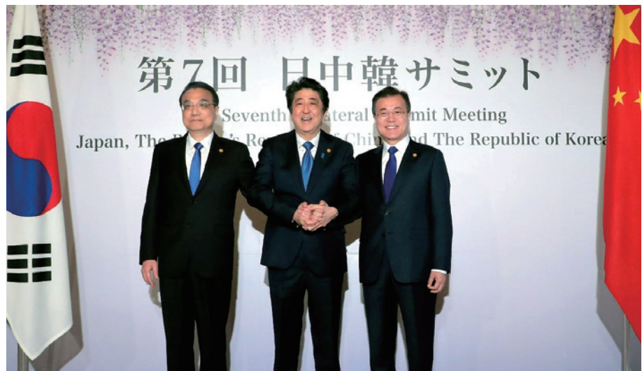
7 th Trilateral Summit

After the Summit, “Joint Declaration of the Seventh Japan-China-ROK Trilateral Summit” was adopted along with the Annex on the list of trilateral meetings since November 2015. Especially appreciating and welcoming the “Panmunjeom Declaration” agreed at the historic 2018 Inter-Korean Summit, which confirmed their common goal of the complete denuclearization of and the establishment of a permanent peace regime on the Korean Peninsula in accordance with relevant United Nations Security Council Resolutions, the leaders also adopted “Joint Statement on the ‘2018 Inter-Korean Summit’ by the Leaders of Japan, the People’s Republic of China and the Republic of Korea”.