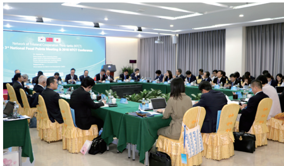
3 rd NTCT National Focal Points Meeting

At the 3 rd NTCT National Focal Points Meeting, representatives from the three national focal points and the TCS exchanged views on the work plan of NTCT in 2019 and the role of the TCS in further promoting NTCT and the trilateral cooperation. At the 2018 NTCT Conference, scholars from the three countries shared their insights on future trilateral cooperation in 3 Sessions under the themes of “Trilateral Cooperation in the New Security Context”, “Trilateral Cooperation in East Asian Economic Cooperation and Integration” and “Trilateral Cooperation in Fourth Market: ‘3+X’ as a New Approach”. Based on in-depth analyses and discussions on the current situation of trilateral cooperation as well as regional and international changes, participants proposed meaningful policy suggestions on future regional cooperation in Northeast Asia.