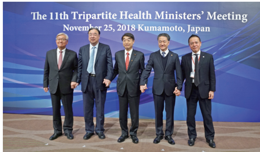
11 th Tripartite Health Ministers' Meeting

The 11 th Tripartite Health Ministers' Meeting was held in Kumamoto, Japan on November 24-25, 2018. The three ministers reviewed the achievements in the past 10 years under the Tripartite Health Ministers' Meeting and exchanged their views toward future cooperation. At the meeting, an active discussion was conducted on three main agendas including 1) infectious disease preparedness and response, 2) healthy aging and non-communicable diseases (NCDs), and 3) universal health coverage (UHC) and disaster health risk management. The meeting adopted the "Joint Statement of the Eleventh Tripartite Health Ministers' Meeting" and was followed by the press conference.