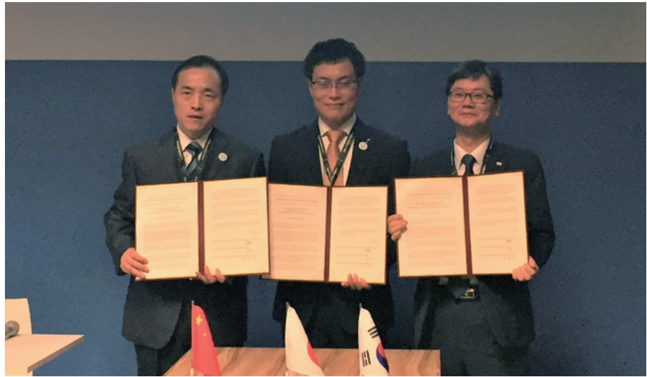
3 rd Trilateral Ministerial Meeting on Water Resources

The 3 rd Trilateral Ministerial Meeting on Water Resources among Ministry of Land, Infrastructure, Transport and Tourism of Japan, Ministry of Water Resources of China, and Ministry of Land, Infrastructure and Transport of the ROK was held on March 19, 2018 in Brasilia, Brazil on the occasion of the 8 th World Water Forum. The three ministers presented each country's domestic and international efforts to achieve water-related Sustainable Development Goals and discussed measures to promote trilateral cooperation in the water sector.